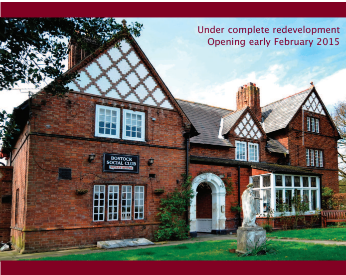
Under complete redevelopment Opening early February 2015